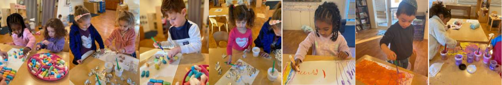
We have been working all week on a collabrative mural menorah that is hanging in our classroom. Every candle of the Menorah was made with a different material or medium.