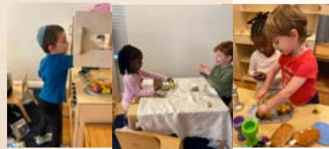
Shabbat Table setting and cooking