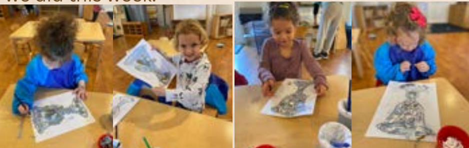
Kiddush cup sensory art