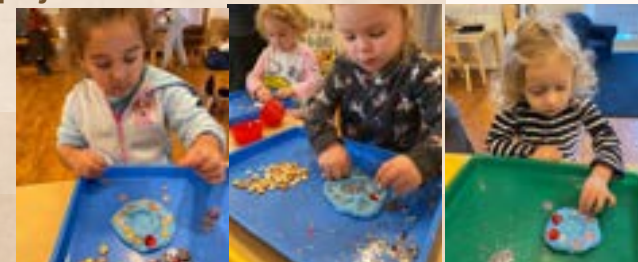
Candle holder craft