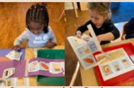
Sequence activity. Putting the parts of the story in order