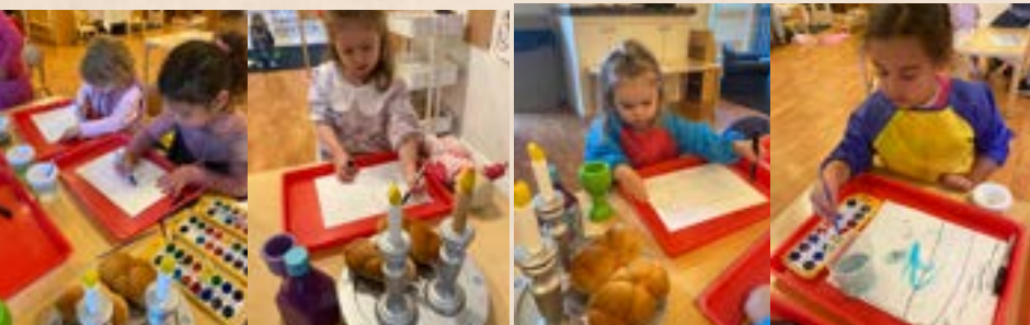
Shabbat Still Life. Draw what you see and then paint it with watercolor.