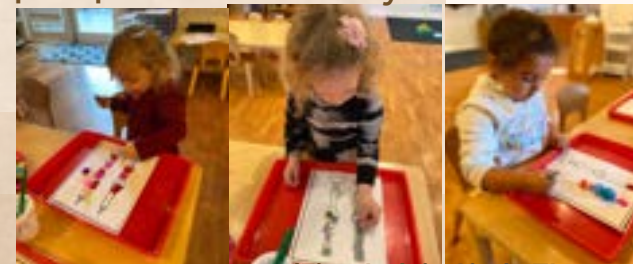
תאנים/Figs Judaica Circle Time