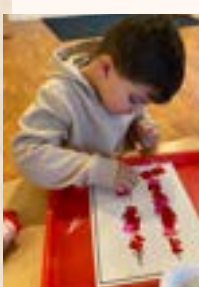
Sensory Candle sticks