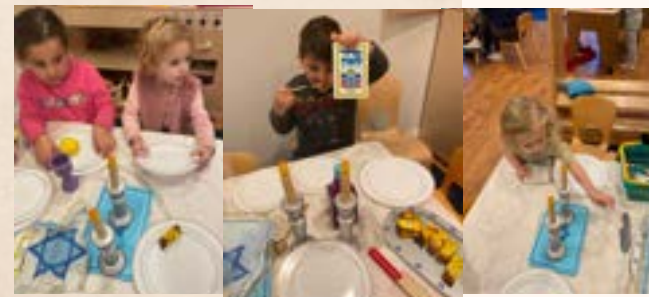
Shabbat Table setting in our dramatic play