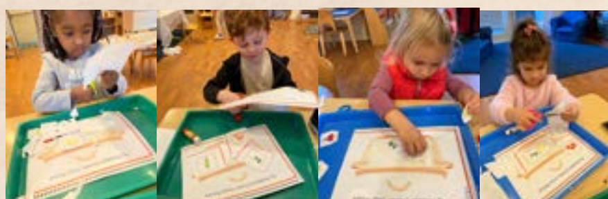
Cutting out our own Chicken soup recipes